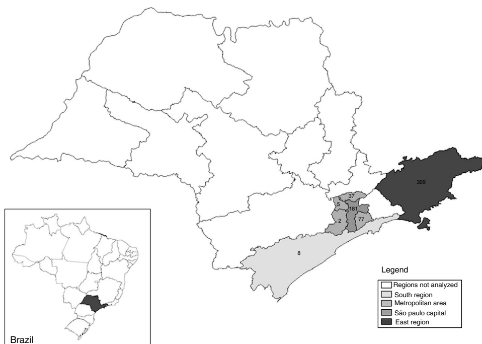
Fig. 1 – Map of Brazil highlighting the state of São Paulo and the regions where the samples for HCV viral load measurement were collected. The number of samples from each region is depicted.

HCV viral loads were abstracted from laboratory records and analyzed according to the type of viral infection or co-infection.