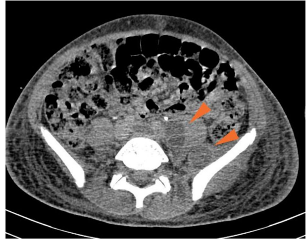
Computed Tomography of the abdomen: The image evidenced an extensive abscess in the left psoas, shown here by the red arrows.

On October 19 th , 2019, a 15-year-old boy from a low-income neighborhood of Rio de Janeiro, with no previous history of travel outside Brazil and with no comorbidity, entered a Brazilian university hospital with a two-week history of lumbar pain and polyarthralgia after a body trauma during a soccer game. Upon admission, the patient was febrile and presented edema, redness, and heat in right elbow and left shoulder, suggesting a disseminated and complicated S. aureus SSTI. Computed tomography (CT) of the abdomen evidenced an extensive abscess in left psoas (Fig. 1) and peripheral pulmonary embolic lesions, with no documentation of endocarditis in the transesophageal echocardiogram. Also, a magnetic