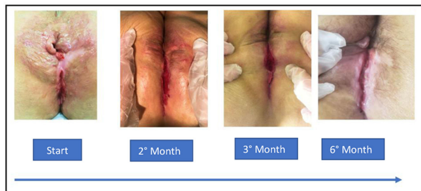
Fig. 2 – Perianal region. The lesions evolution over time with treatment with a tuberculostatic regimen.

PPD is positive in 75% of cases, but it can be negative in patients with perianal TB 14 as it was the case in the patient in this report due to decreased host defense against TB. A culture for M. tuberculosis from the seropurulent secretion from perianal fistulous tracts and tissue of these fistulas and from intergluteal sulcus was negative. Although the gold standard for the diagnosis of TB recommended by the WHO is the use of culture, the proportion of disease with negative culture ranges from 15% to 20%, even in patients with pulmonary TB. These patients are less likely to have a cough, weight loss, and pulmonary cavitation, as it was the case in the present patient. This presentation may occur because the mycobacteria are more contained in the granulomatous tissue or may