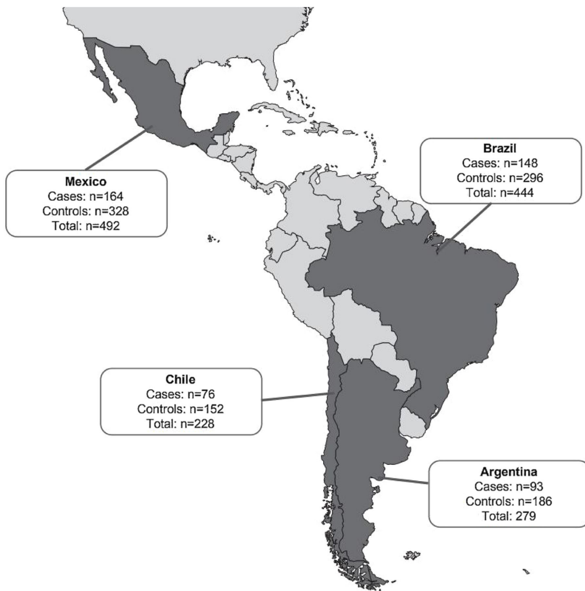
Fig. 2 – Patient distribution by country.

whereas patient admission from an emergency department was more common in the control group (21.7%; 209/962) than among cases (12.7%; 61/481) [ p < 0.001 ].