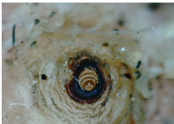
Fig. 4 – Pigdial area and respiratory spiracles of Tunga Penetrans .

but is considerably less than 20 \mu\text{m} . Only fluids with no surface tension can penetrate into such small openings.