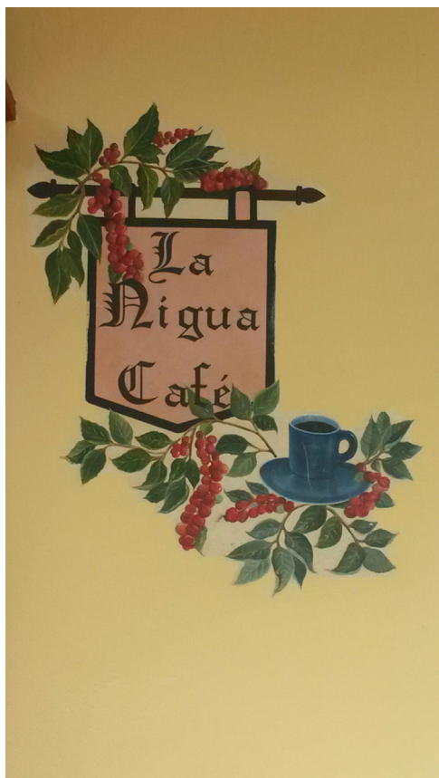
Fig. 1 – Name plate of a coffee shop in Popayan, Southwest Colombia, reflecting that tungiasis was common in the town. Nigua is a popular name in Spanish for the sand flea.

Data on geographical disease occurrence in the Americas is scanty, but indicate that tungiasis exists in Mexico, Honduras, 2 Venezuela, Colombia, 3 Ecuador, Peru, Paraguay, Argentina, Haiti, Barbados, and Trinidad. 3,4 In Brazil tungiasis is reported from Amazonia State in the North to Rio Grande do Sul State in the South. 5 Several community-based studies performed in Brazil, Haiti and Trinidad-Tobago showed astoundingly high prevalence in resource-poor rural and urban communities.