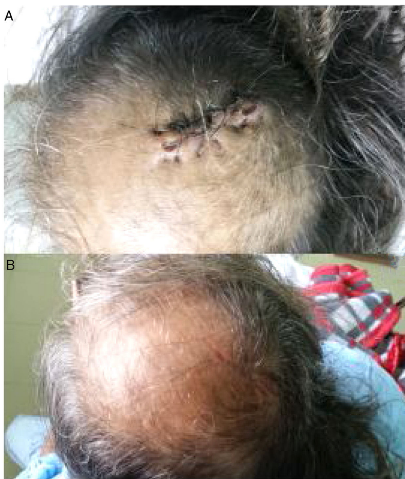
Fig. 2 – (A) One-week post-operative wound after surgical debridement of chronic skull osteomyelitis in an HIV-infected patient. (B) Three-week post-operative wound aspect.

showed 75 cells/mm 3 (90% neutrophils), proteins of 250 mg/dL, glucose of 36 mg/dL, negative India ink and positive cryptococcal antigen test using lateral flow assay. In bone tissue, direct fungal exam was compatible with yeast of Cryptococcus and culture showed C. neoformans (Fig. 1D). In addition, CSF culture confirmed the presence of this fungus. Chest X-ray and CT were normal. The patient received amphotericin B deoxycholate 50 mg/day and 5-fluocytosine 100 mg/kg/day. After five days, there was significant improvement of all symptoms. Nevertheless, after 15 days of treatment, the patient presented acute renal injury and anemia. Thus, his antifungal treatment was changed to amphotericin lipid complex and fluconazole 800 mg/day. Finally, after 29 days of treatment, the patient was asymptomatic and showed negative fungal cultures of his CSF, being discharged and using fluconazole 400 mg/day up to complete 10 weeks of treatment and switching to on fluconazole 200 mg/day. The surgical wound showed signs of adequate cicatrization throughout hospitalization and later on during follow up, without complications (Fig. 2A and B). One year later, the patient remained asymptomatic with a T-CD4+ lymphocyte cell count of 41 cells/mm 3 and undetectable viral load.