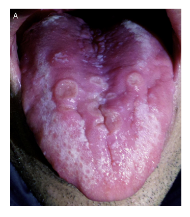
Fig. 1 - Asymptomatic ulcerated lesions in the tongue.

Article history: Received 1 June 2013 Accepted 7 June 2013 Available online 23 October 2013