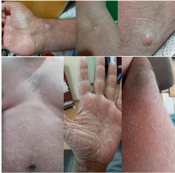
Fig. 3 – Exfoliation reached the entire skin, including scalp, palms of the hands and soles of the feet, and was associated with sparse pustules and hyperpigmentation, especially in skin fold regions.

aspartate amino transferase, 31–89 U/L; alkaline phosphatase, 162–169 U/L; increased serum C-reactive protein (2.95–3.40 mg/dL); bilirubins, glucose, lipase, amylase, calcium, magnesium, and creatine phosphokinase remained normal throughout the clinical evolution. Tests for dengue, hepatitis A, hepatitis B, cytomegalovirus, syphilis, and AIDS were non-reactive. The attempt to taper off corticosteroid therapy worsened the dermatological condition, with lichenification, pigmentation, and skin fissures over the joints. Weight loss, loss of muscle mass, generalized myalgia, weakness, and fasciculation in the limbs made walking difficult. The magnitude of the skin lesions and the acute hepatitis in the presence of SARS-CoV-2 infection, in addition to the use of carbamazepine, led us to consider overlapping pharmacotoxicity. Therefore, carbamazepine discontinuation started on D43, 2020, with marked improvement of the rash and progressive skin recovery. The patient did not show any respiratory changes since the onset of symptoms, maintaining O 2 saturation around 98%.