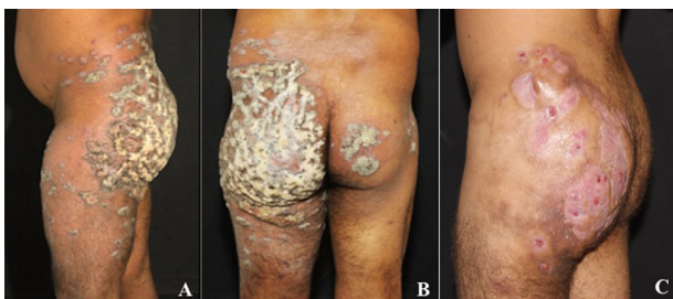
Fig. 1 – A 26-year-old male farmer presented a verrucous plaque in the left side of the buttock (A), that spread to the right one (B). A marked improvement of the skin lesions caused by M. tuberculosis was observed after treatment, performed with rifampicin, isoniazid, pyrazinamide and ethambutol during six months.

A 26-year-old male farmer, residing in Belém, Pará State, Brazil, presented to the outpatient service of Dermatology