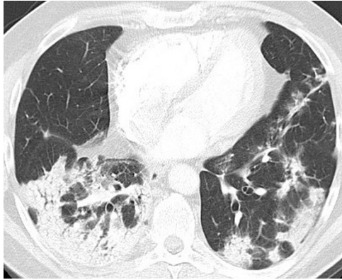
Fig. 1 – Pulmonary CT angiography to assess pulmonary embolism (PE) obtained on illness day 21. CT axial image (lung window) showed peripheral areas of consolidation in both lower lobes. Incipient architectural distortion is seen in central portions of the lungs. CT findings were suggestive of OP. PE was absent.

Corticosteroids are the standard therapy for OP, and patients usually experience pronounced clinical response within a few days. 5 The question of whether an approach with a high dose of corticosteroids would be beneficial for patients with OP secondary to COVID-19 remains to be answered. Herein we report a series of three cases with OP that responded dramatically to corticosteroids. To the best of our knowledge, this is the first report to analyze this issue.