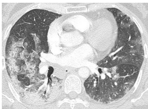
Fig. 3 – Pulmonary CT angiography on illness day 14. A pattern of OP is seen in the right middle and right lower lobes (consolidation and ground-glass opacities with perilobular distribution). Patchy areas of ground-glass opacities in the left lung. No signs of PE.

the CT scans. All patients received prednisone at 1 mg/kg PO and experienced rapid improvement: they were weaned off ventilatory support and discharged within a few days.