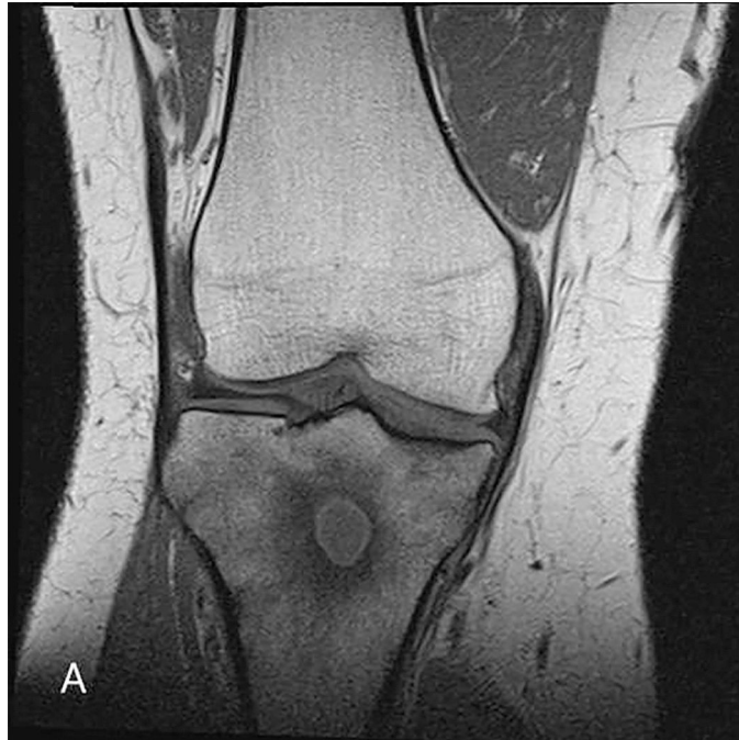
Fig. 1A – T1 coronal MR image shows a Brodie's abscess with the characteristic “penumbra sign” (thin mildly hyperintense rim of granulation tissue surrounding a low intensity fluid filled abscess cavity).