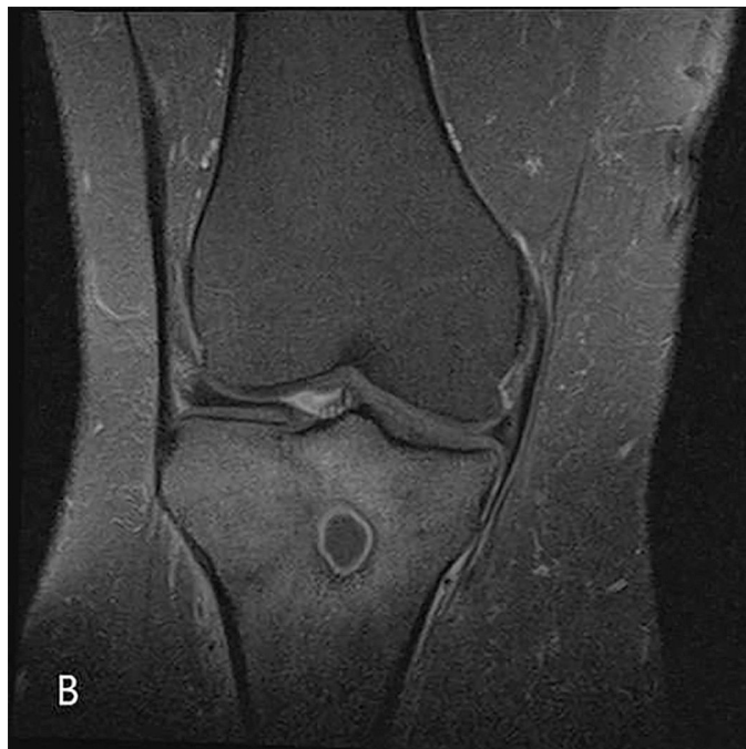
Fig. 1B – T1 post contrast fat saturation image shows enhancement of the granulation tissue.

was discharged on the fifth postoperative day. At follow-up 2 months after surgery, she remained free of symptoms (Fig. 1).