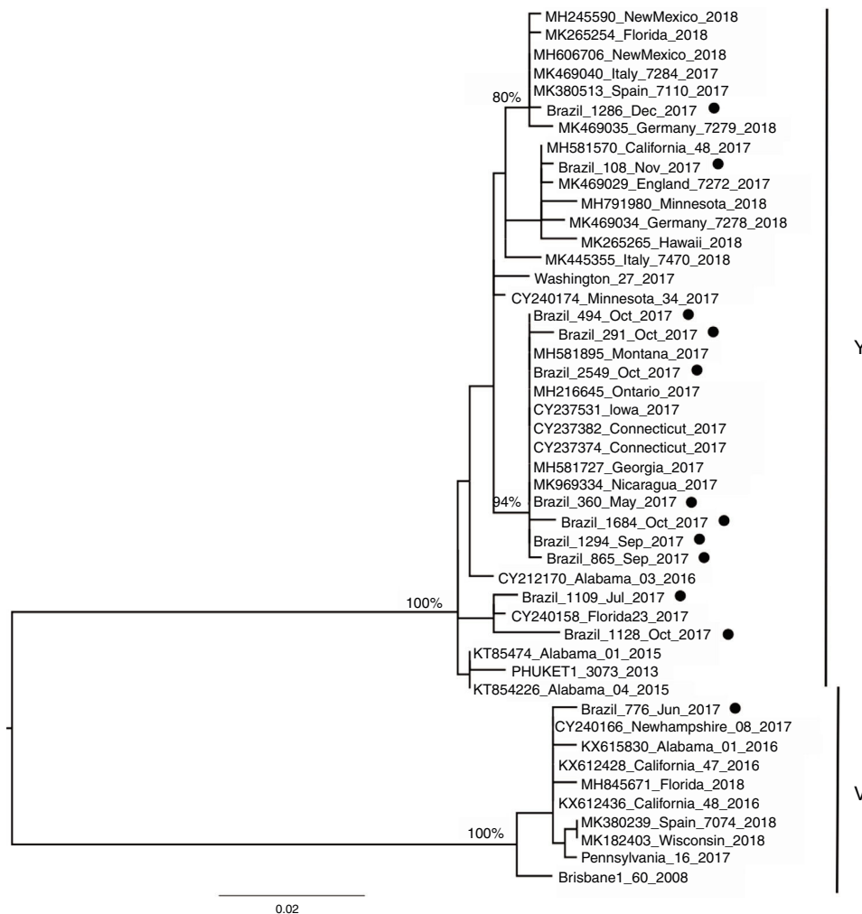
Fig. 2 – Maximum likelihood phylogenetic tree of influenza B HA. Black dots demonstrate the clinical samples from this study. Yamagata lineage and Victoria lineage are indicated by Y and V letters aside the respective clusters. Bootstrap values above 80% are depicted in the key nodes.

and advised to seek medical attention sooner than the general population.