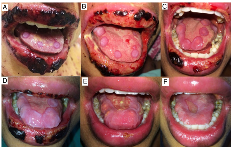
Fig. 3 – (a-f). Concentric, round, erythematous and well-limited erosions on tongue surface (a, b), that increased in size and coalesced (c-e) until remission (f).