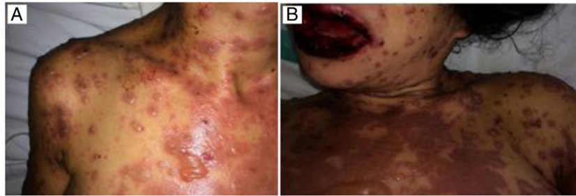
Fig. 1 – Cutaneous lesions at hospital admission (a) and during treatment (b), revealing epidermis detachment from the underlying dermis, leading to bullae.

following: integrase inhibitor, non-nucleoside reverse transcriptase inhibitor, or protease inhibitor with a pharmacokinetic enhancer. 1,2