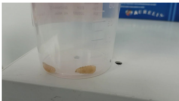
Fig. 2 – Two of the four extracted larvae.

of the lips. She was advised to apply petrolatum jelly to the area. This nodule experienced involution over the next four days. There was no evidence of larval presence in this lesion.