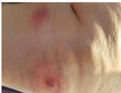
Fig. 1 – Boil-like lesions with serosanguinous secretion.

Two days later, on September 13, she noticed a pale, non-tender nodule on her lower vermilion border on the right side