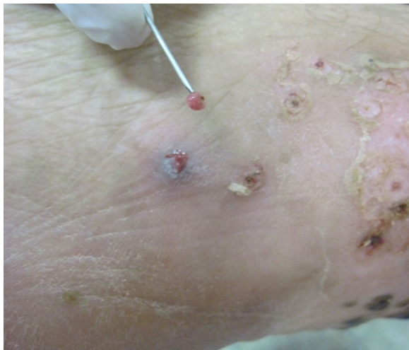
Fig. 3 – Surgical extraction of a flea with a sterile needle.