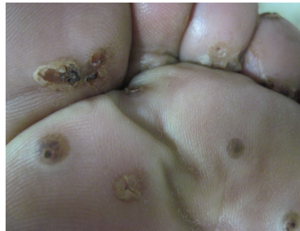
Fig. 1 – Multiple yellowish-brown papules and nodules affecting the interdigital spaces and the sole of the left foot.

Tungiasis is an ectoparasitic skin disease caused by the penetration of the pregnant female sand flea Tunga spp. into the epidermis. 1,2 This neglected tropical disease is an important healthcare issue due to its significant morbidity and endemicity in several Latin American countries, the Caribbean, and sub-Saharan Africa, particularly in resource-poor communities. 3 However, several cases have been reported throughout the world in travelers returning from endemic areas. Although any location of the skin can be affected, lesions predominantly occur on the feet after contact with sand or sandy soil containing fleas. In some instances, tungiasis is associated with physical disability, chronic pain, skin complications and secondary bacterial superinfections. 1,2 Diagnosis is clinical and may be