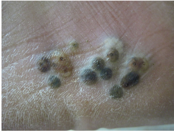
Fig. 2 – Multiple yellowish-brown papules and nodules with central black spots (the posterior end of the fleas) and indurated halos on the patient's left sole. Xerosis is also observed.