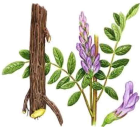
Fig. 1 – Photograph of Glycyrrhiza glabra herb.

Licorice herb ( Glycyrrhiza glabra - G. glabra ) has routinely been used for centuries in traditional Chinese. 11 Roots and rhizomes of this herb has been reported to be antioxidant, antimicrobial, and antiviral. 12,13 Furthermore, G. glabra has anti-inflammatory, anticancer, and anti-ulcer activity. 14-16 Licorice is extracted from the root of G. glabra herb and one of its active ingredient is glycyrrhizin acid, which due to its affinity to mineralocorticoid receptors may result in edema and hypertension. Therefore, it should be used with caution in patients suffering from cardiovascular disease and/or hypertension. 17 (Fig. 1).