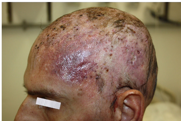
Fig. 4 – Day 10 after admission: persistence of erythematous lesions dispersed over the scalp region. Note the tiny ulcers covered by black eschars.

administration, the facial palsy and scalp purulent drainage remained (Fig. 4). During hospitalization, recurrent episodes of severe neutropenia were observed and improved by the addition of granulocyte colony-stimulant factor. In parallel, the patient developed several episodes of catheter-associated sepsis due to Pseudomonas aeruginosa , Methicillin-resistant Staphylococcus aureus , and ESBL-producing Klebsiella pneumoniae . A repeat CT scan after 6-weeks of antibiotic and antifungal therapy still showed mucosal thickening and a small fluid level in the left maxillary sinus, extensive opacification of sphenoidal sinus and a small bone discontinuity of the intersphenoidal sinus. The patient was unsuitable for sinus biopsy due to the ongoing bloodstream infections. After eight weeks of follow-up, the patient had received a cumulative dose of 2 g of amphotericin B. The patient died on the 49th day of hospital admission and the 41st day of antifungal therapy.