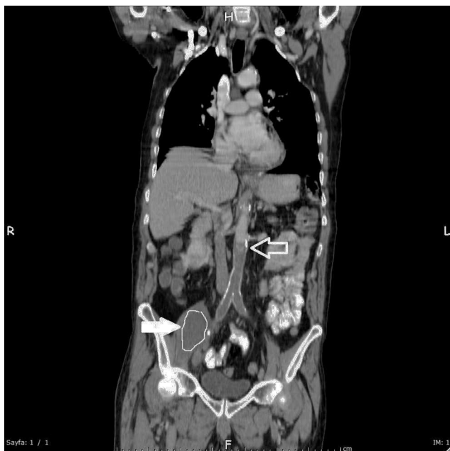
Fig. 2 – In the coronal section of the oral and intravenous contrast-enhanced abdominal CT; initial localization of the infrarenal occlusion in the abdominal aorta (hollowarrow), a hypodense heterogeneous abscess leading to expansion of right psoas muscle (arrow).