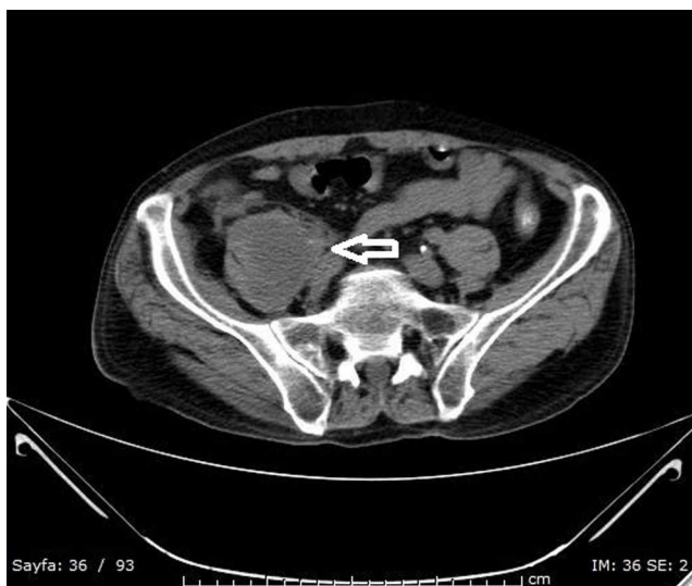
Fig. 3 – In the axial non-contrast abdominal CT; formation of a hypodense heterogeneous abscess leading to expansion of right psoas muscle which is accompanied by increased densities in the neighboring fatty tissue (hollowarrow).