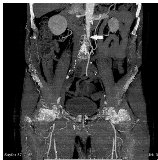
Fig. 1 – In the coronal section of the intravenous contrast-enhanced abdominal CT; initial localization of the infrarenal occlusion in the abdominal aorta (arrow).

Common and applicable diagnostic methods are available for brucellosis. However, its life-threatening complications remain critical. Herein we present a 68-year-old patient who complained of leg pain for two months. At admission he had absent pulse in the left femoral and bilateral popliteal arteries. Laboratory test results were leucocytes 8700/\text{mm}^3 , CRP 86 \text{ mg/L} , and ESR 47 \text{ mm/h} . Abdominal CT revealed images consistent with mural thrombus in the suprarenal segment of abdominal aorta, total occlusion and hypodense thrombus material completely filling the aortic lumen through infrarenal segment extending to lumens of the caudal, bilateral common and superior iliac arteries (Figs. 1-3). No paleness, coldness or color change was detected in the lower extremities. The patient had fever, right inguinal swelling, and sweating. Abdominal CT showed an aortic thrombus and a hypodense lesion of 58 \text{ mm} \times 61 \text{ mm} \times 100 \text{ mm} in the right psoas muscle. The repeated Brucella STA test was positive in 1:5120 titer. USG-guided drainage of the psoas abscess was performed and a treatment with doxycycline and rifampicin was administered for three months (Fig. 4). The patient was not operated on and progressed with no clinical complaints.