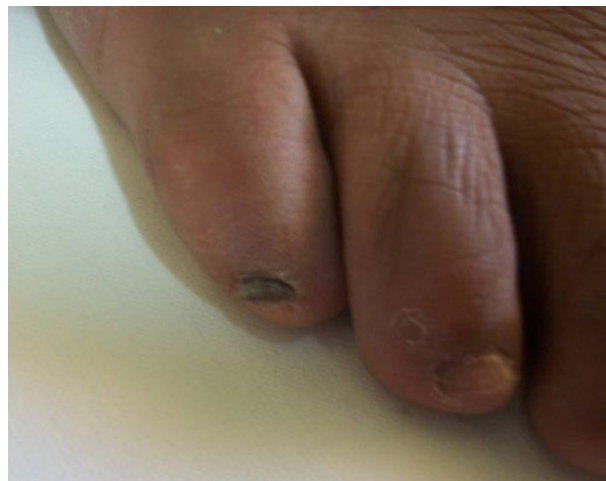
Fig. 3 – Total dystrophic onychomycosis due to Microsporium nanum .

The duration of Microsporium onychomycosis prior to presentation at our Institute varied widely, from one month to 20 years (mean 6.55 years). Only three patients sought medical care with disease duration of one year or less, one of them had M. gypseum onychomycosis. The others had suffered from onychomycosis for many years. None of the patients had tinea