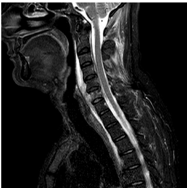
Fig. 1 – MRI sagittal slide of the cervical spine (STIR sequence) showing spondylitis of the sixth cervical vertebra with prevertebral abscess and infiltration of the neighboring soft tissues and muscular compartment in a 52-year-old immunocompetent man.