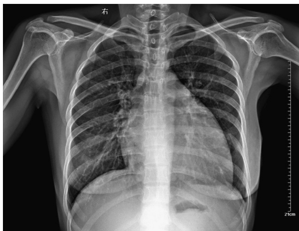
Fig. 1 – Chest radiography showed an enlarged and globular cardiac silhouette and pulmonary congestion without pleural effusion.

Physical examination revealed blood pressure of 130/90 mmHg, heart rate of 122/min, a dilated jugular vein, and an audible gallop rhythm and systolic ejection murmur. There was mild peripheral edema. Chest radiography showed an enlarged and globular cardiac silhouette and pulmonary congestion without pleural effusion (Fig. 1). Serum free T3, T4, total T3, T4 and thyroid stimulating hormone (TSH) were within normal values with levothyroxine replacement therapy at a dose of 50 \mu g daily. Cardiac enzymes, liver enzymes, erythrocyte sedimentation rate and C reactive protein were normal. Antinuclear, antithyroid peroxidase and antithyroglobulin antibodies were positive. Rheumatoid