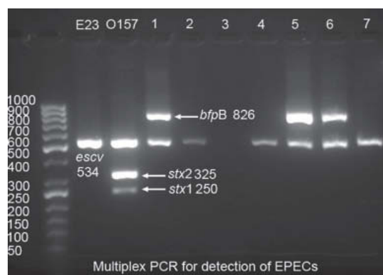
Figure 1: Multiplex PCR for detection of EPECs. Lanes 1-7 showing strains identified as typical and atypical EPEC.

This multiplex PCR differentiates STEC and EPEC and also divides the later into two groups, i.e. typical and atypical EPEC. Strains with escv+ , bfp+ traits are considered typical and isolates with escv+ , bfp- are atypical EPEC. The PCR was performed in a 25 µL reaction mixture consisting of 1 U of Taq DNA polymerase with the corresponding Taq polymerase buffer, a 0.3 mM concentration of each deoxynucleoside triphosphate, and a 0.4 mM concentration of each PCR primer. Thermocycling conditions were as follows: 95°C for 5 min, followed by 30 cycles of 95°C for 1 min, 58°C for 1 min, and 72°C for 1 min, with a final extension at 72°C for 5 min. The sequence of primers and expected PCR product with the appropriate size are shown in Table 1. The PCR products hence obtained were run on 1% gel and the gels were visualized by gel Doc system (Figure 1).