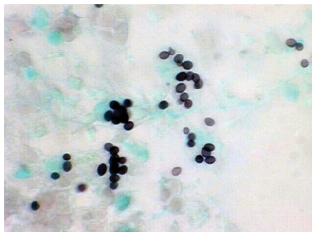
Figure 2: Cytology of lymph node aspirate. Many yeast-like fungal forms of round and oval shape and varied sizes are seen. Some fungal structures demonstrate polar sprouting (Grocott; 400X).

The patient progressed with remarkable clinical recovery and had remission of fever and neutropenia after the 2 nd and 12 th day of amphotericin B use, respectively. After a total dose of 1,850 mg, administered in 40 days, the patient had already showed complete remission of adenomegaly and almost complete bone marrow recovery, persisting with mild anemia (Hb = 11.8g/dL). At that time, the patient was discharged using fluconazole at 300 mg, PO, twice a week for 8 weeks. Three months after the end of treatment, the patient was asymptomatic and had complete bone marrow recovery. Thalidomide was maintained during the whole period of treatment (100 mg/day).