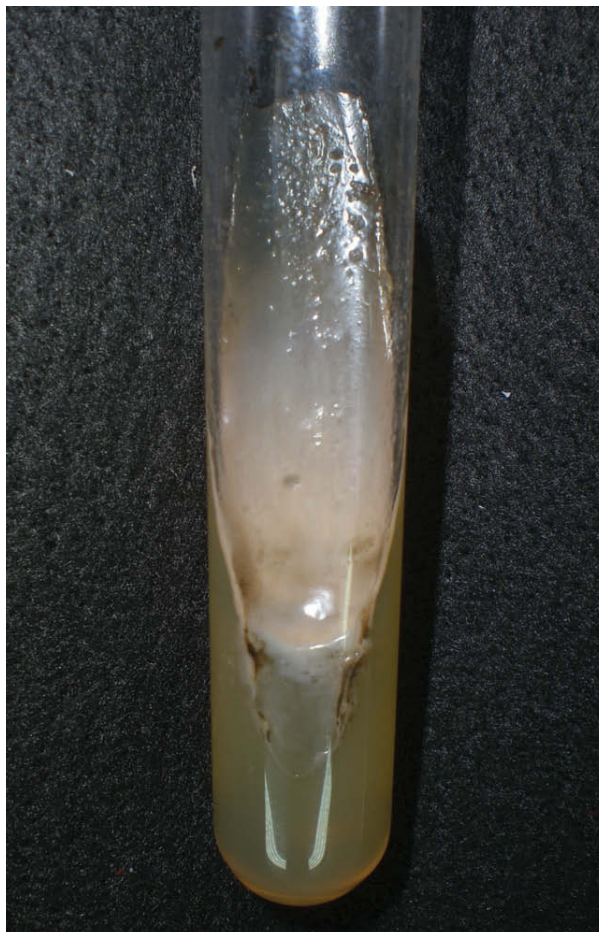
Figure 4: Macroscopy of fungal colony obtained in the material from lymph node aspirate. Yeast-like colonies of beige color, with initial points of dark pigment in areas after 30 days of incubation (agar-Sabouraud, 35°C).