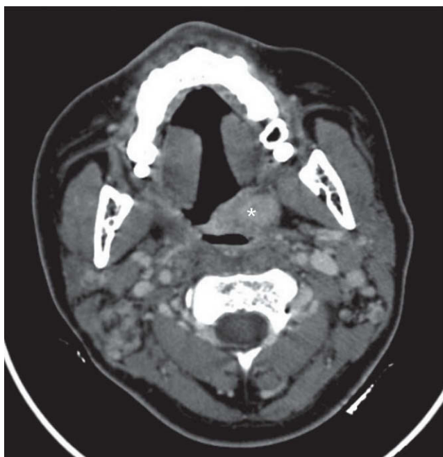
Figure 1: CT scan with contrast of the neck. High-enhanced exophytic lesion in the soft palate region on the left. Presence of multiple enlarged lymph nodes of the neck chains (*).

Further radiological investigation using CT scan showed a contrast-uptake solid lesion, involving the left side of the soft palate and palatoglossal and palatopharyngeal arches, measuring 30 mm in diameter, associated with multiple non-confluent adenomegaly of bilateral cervical chains (Figure 1). Abdominal CT scan confirmed the clinical findings, showing a mild increase in spleen volume. Myelogram showed hypocellular bone marrow with shift to the left, compatible with bone marrow aggression, without parasites or fungi in the analyzed sample. A rapid rK39 immunochromatographic dipstick test (Kala-azar Detect™ Rapid Test, InBios International, Seattle, WA, USA) was also performed and turned out negative. Blood cultures did not grow fungal or bacterial agents and laryngoscopy revealed no findings suggestive of neoplasm.