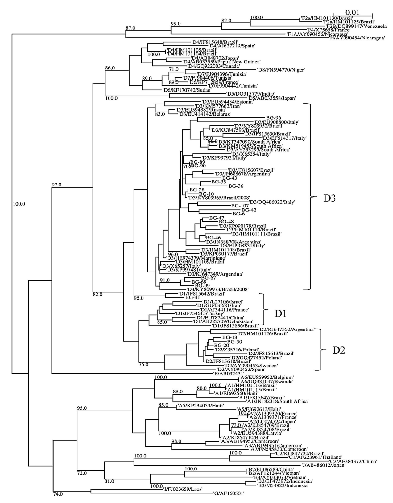
Fig. 2 – Phylogenetic tree of S/P gene fragment (590 bp) of 21 patients with active hepatitis B infection in Bento Gonçalves city, Rio Grande do Sul State, 2010. The sequences evaluated in this study are represented by the acronym BG (Bento Gonçalves) followed by the identification number of the sample. Sequences obtained on GenBank are demonstrated by the subgenotype information followed by the sequence accession number. The numbers at each node correspond to bootstrap values (greater than 60%) obtained with 1000 replicates. The scale bar indicates the genetic distances.