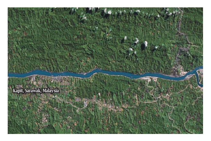
Figure 1: Satellite photograph of the city of Kapit geographical area and its surrounding forest. The area is particularly rich in rivers and channels.

districts. Furthermore, in all the four deceased patients, P. knowlesi DNA was found in associated with an elevated parasite load and a remarkable liver-kidney dysfunction.<sup>9</sup> This last quoted paper definitively demonstrated that P. knowl esi , although in its initial forms, has a strict morphological similarity with P. malariae , has a clearly increased clinical impact, and may cause life-threatening diseases.