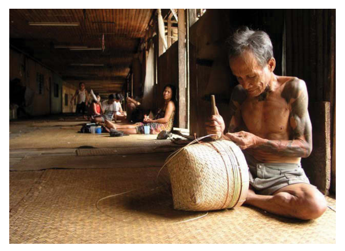
Figure 4: The interior features of a longhouse.

outside the farm. Pig-tail macaques are frequently observed in this region, and one of the farm inhabitants was hospitalized at Kapit Hospital due to a P. knowlesi malaria attack; the distance between the longhouse and the farm is around 5 km. The third examined site is located into the rain forest, 4.5 km far from the Kapit town centre, at an altitude of 1,200 meters over the sea. This forest area has road accessible to equipped motor vehicles, save during the rainy season, when the only access feasible is by foot. Long-tail macaques have been frequently observed in this site, which is located at around one km far from the house of patients hospitalized in 2001 for malaria attack.<sup>23</sup>