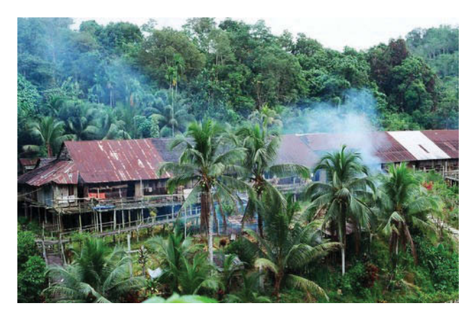
Figure 3: A typical Malaysian longhouse is represented.

humans by A. latens was more elevated at the forest limits (6.74%), while lower rates were found in the rain forest (1.85%) and in the examined longhouses (0.28%).<sup>21</sup> Previous historical studies performed nearly 50 years ago, identified A. hacheri as a possible vector of P. knowlesi,22 but further information excluded that this last mosquito is attracted by humans, while it bites monkeys in their natural environment. The judgement of entomologists is that man may acquire infection in the forest during hunting or returning to the farm at sunset, after the working day. When considering the vector, it acquires the infection from wild monkeys: this opinion is enforced by the absence of epidemic clusters inside the local longhouses, and the fact that the major number of infected mosquitoes has been registered in the forest, or close to the forest edge.21