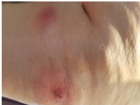
Fig. 1 – Boil-like lesions with serosanguinous secretion.

Two days later, on September 13, she noticed a pale, non-tender nodule on her lower vermilion border on the right side